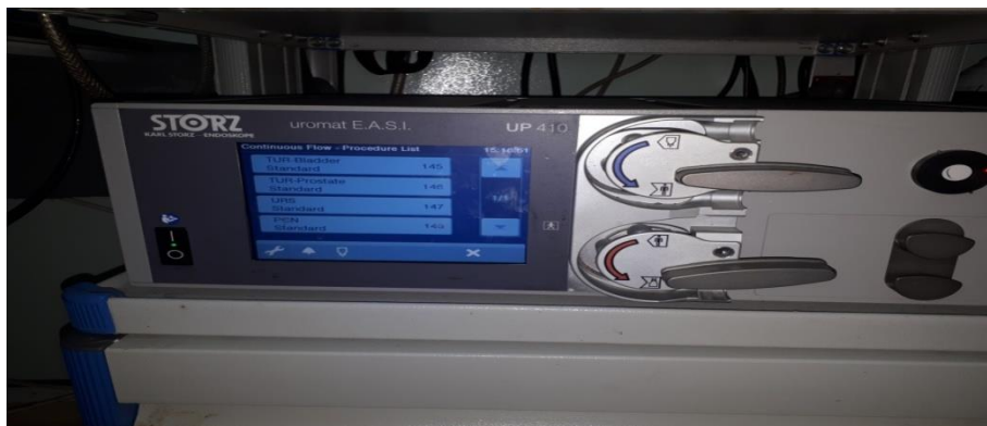
(figure4) : continuous flow irrigation system (uromate E.A.S.I -KARL STORZ) using standard URS setting.

Ureteric stent was placed based on following criteria: