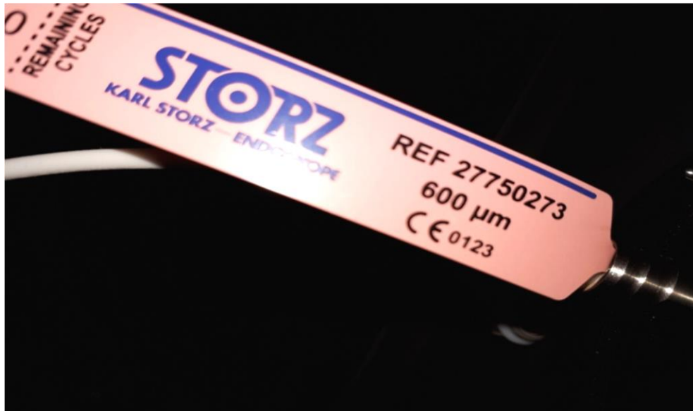
Figure(2): laser fiber sized 600 \mu m quartz end