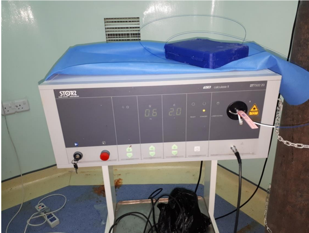
Figure(1): Holmium YAG laser lithotripsy system