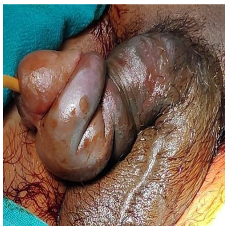
Figure 3: Eggplant deformity hematoma

A 32 year male presented to emergency department with eggplant deformity of penis following rough sexual intercourse. Patient reported to emergency after 24 hour of injury. Surgical exploration revealed 2x1.5 cm transverse defect on bilateral the tunica albuginea. The defects were repaired with 3-0 vicryl suture. Patient gained erectile functions after 20 days of surgery, that was painful to start but normalized at the end of 1 month.