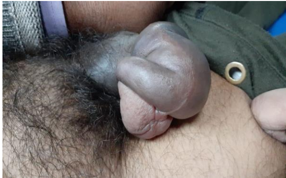
Figure 5: Deformed Penis Albuginea

A 31 year male presented to emergency department with penile injury following vigorous sexual act. Patient reported after 6 hours of the injury. The diagnosis of penile fracture was made clinically and went surgical exploration by degloving incision and transverse defect of size 2x1 cm was repaired with 3-0 vicryl suture over left tunica albuginea. Postoperative period was uneventful. Patient had normal erectile function during follow up.