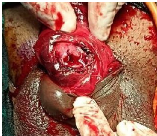
Figure 2: Defect in tunica albuginea