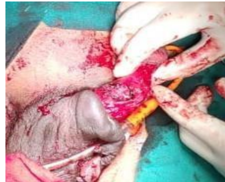
Figure 6: Transverse defect in Tunica