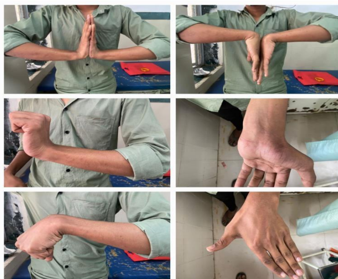
Figure 3. Showing Full flexion, extension, ulnar deviation radial deviation