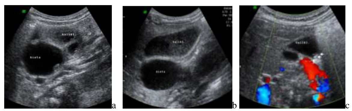
Fig. 1. Echoscopic picture of spherical expansion of the common bile duct with a reduced gallbladder in volume (a); with an increase in the volume of the gallbladder (b); calculous cyst of the common bile duct (c).

An ultrasound scan was performed on 15 (17.4%) of 86 patients who underwent gallbladder size, and 12 of them had signs of chronic inflammation of its wall with deformation in the cervical ductal segment. 5 (6%) patients who had previously undergone inadequate primary operations (cyst drainage) in other hospitals, upon admission to our clinic, did not allow us to differentiate the gallbladder due to the pronounced adhesive process and its intimate fusion with the dilated duct. In 14 (16.7%) of 84 patients with CC in the gall bladder, dense inclusions and calculi with a characteristic acoustic pathway were revealed. In 11 (78.6%) of 14 patients with bile duct cyst, stones were established before surgery as a complication of bile duct cyst, and in 3 (21.4%) cases it was found during surgery. Echography in 8 out of 14 patients with no inclusions in the gallbladder revealed different densities in the lumen of the enlarged bile duct with a pronounced acoustic pathway, indicating the presence of calculus - choledocholithiasis, confirmed during surgery. Stones in 3 patients were localized in the gall bladder, in 8 - in the enlarged common bile duct, in 3 - in the gall bladder and in the cavity of the cyst.