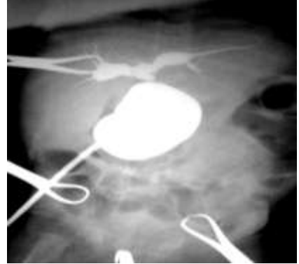
Fig. 4. IOCH. Cystic expansion of extrahepatic bile ducts with symmetric expansion of intrahepatic bile ducts.

The data of complex preoperative (ultrasound, MSCT) and IOCH studies showed the heterogeneity of the forms, sizes and length of the cystic expansion within the extra- and intrahepatic ducts and finally verify its anatomical version. Cystic enlargements are most often localized in the extrahepatic segment of the bile ducts of various lengths and diameters in the form of types I and IV and correlates with literature data on the rarity of types II, III, V, and VI of cystic lesions of the biliary tract. With IOCH in 54 (74%) children, the shape and size of the cystic expansion usually coincided; in 19 (26%) cases, there was a slight increase in the size of the cystic expansion, probably due to stretching of its wall during tight filling with contrast medium during cholangiography (Fig. 4).