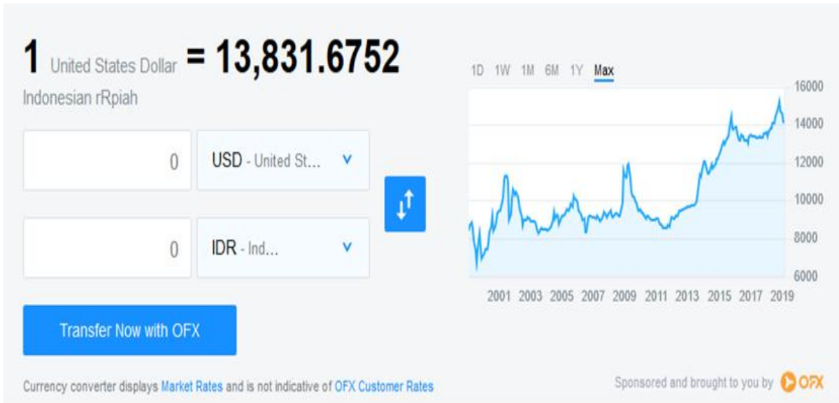
Fig 3: Exchange Rate in Indonesia