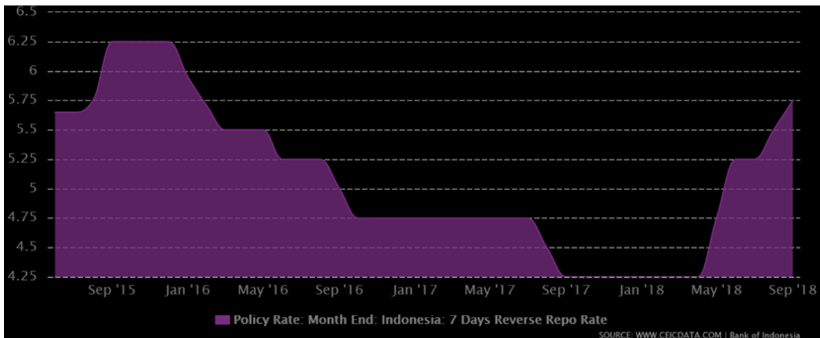
Fig 4: Indonesian interest rates

Based on these data shows that for 15 years, from 2004-2018 Indonesia underwent an increase in the exchange rate against the Dollar. At the end of 2011 it almost touched the price of 8,000, but towards the end of 2018 there was a very high increase, which was at more than 15,000, an increase of almost 100% from 2011 was the worst number for Indonesia.