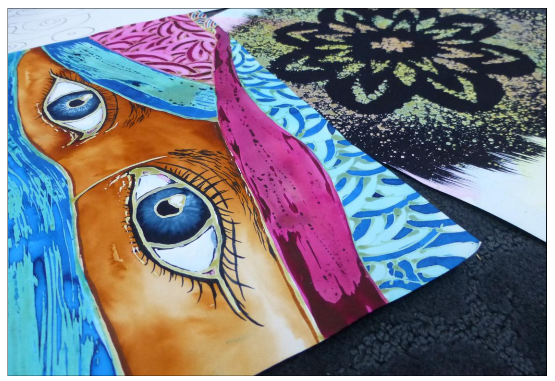
Figure 6: Illustration of Disabled Participant

personal experience of the participant can fulfill the artistic expression of outdoor activities. By following the needs of the visual arts program, the experienced physically handicapped participants have been impressed with the artistic theory.