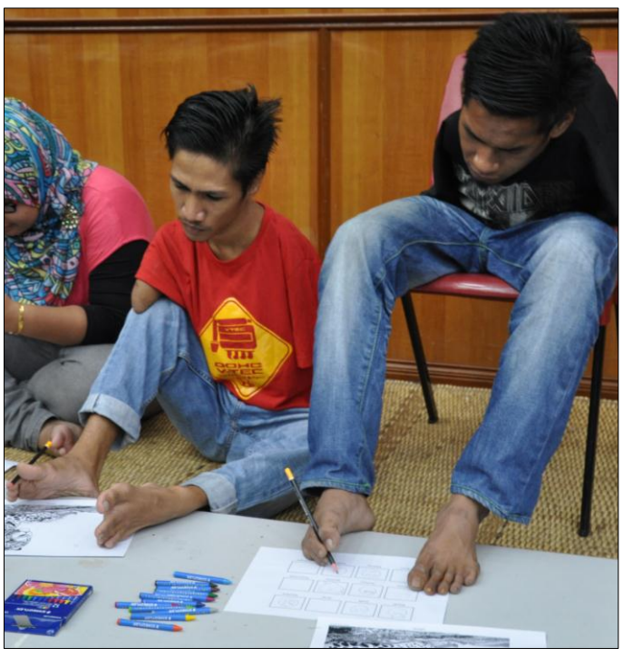
Figure 5: Persons with Disabilities (Physical) in the Final Sketch Session

participants showed how they interacted with the theme in the prescribed exercise. Participants' observations were conducted by collecting works to assess their level of capability.