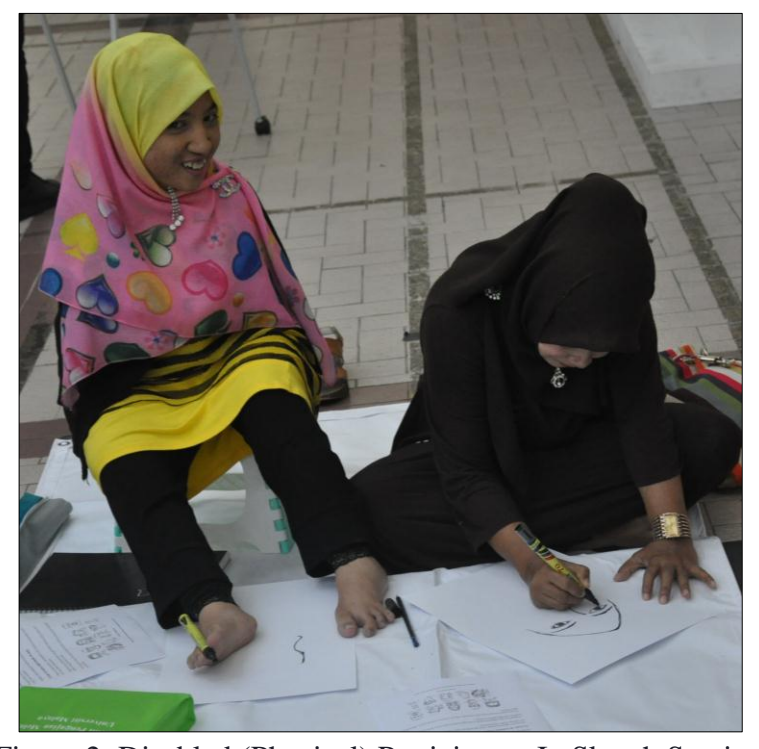
Figure 2: Disabled (Physical) Participants In Sketch Session

The concept of 'practice' is related to the specific physical partnership of the individual participant. This has been linked to an understanding of the factors that the participants need to comprehend in visual arts. The activity relates to the presence of physical experience by individuals who are impressed with the interaction of responsive thinking. Based on Arnheim (1969), conceptual thinking and ideas are thought out through observations leading to physical complications. The appropriate subject matters should involve in behaviour and characters by individual participants in relation to practice. According to Gibson (1979), in the capacity of the theory, it is suggested that the understanding must be address by potential and appropriate artistic individuals in actions. Furthermore, participants need to see the capabilities and relationships provided.