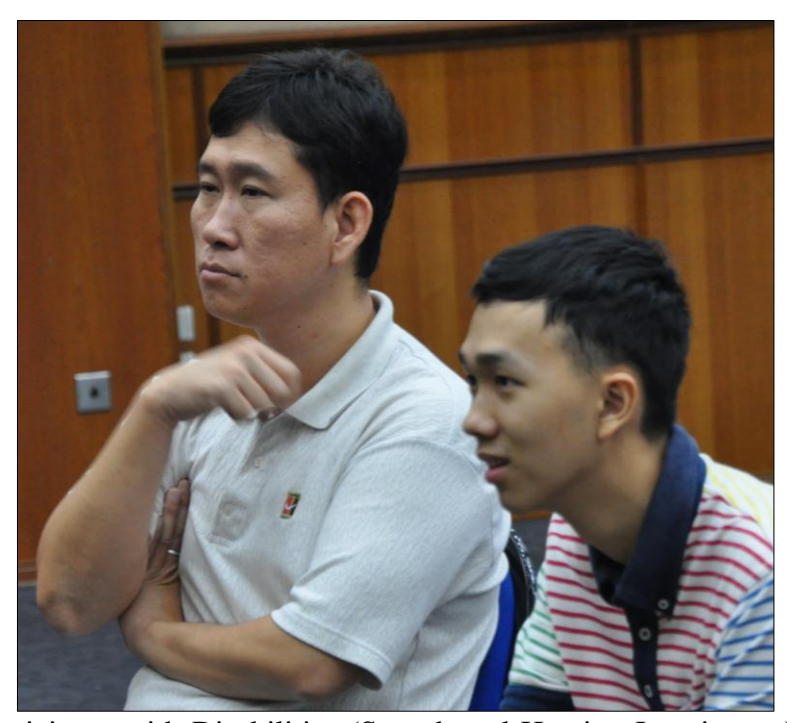
Figure 1: Participant with Disabilities (Speech and Hearing Impairment) in Briefing Session