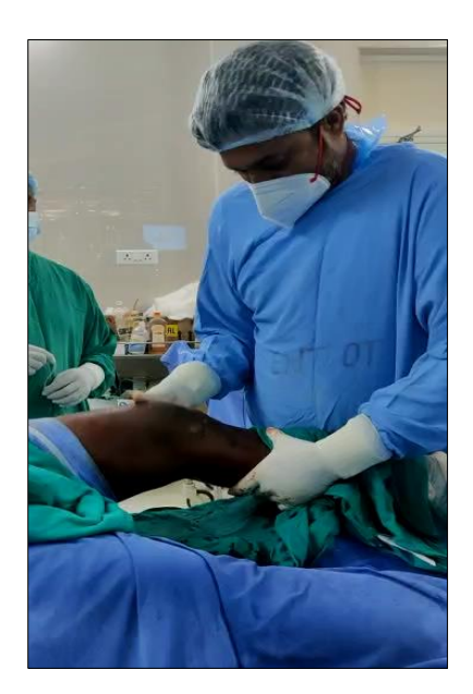
Fig 5: Post-operative Stability check