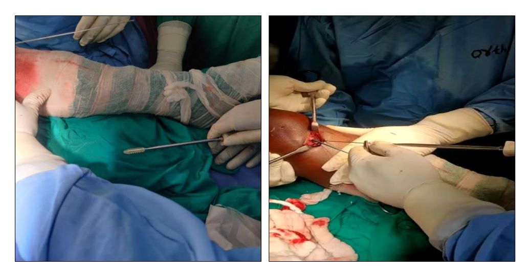
Fig 4: Graft Fixation