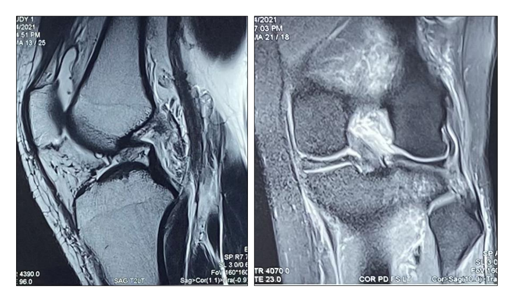
Fig 1: MRI Images of Knee