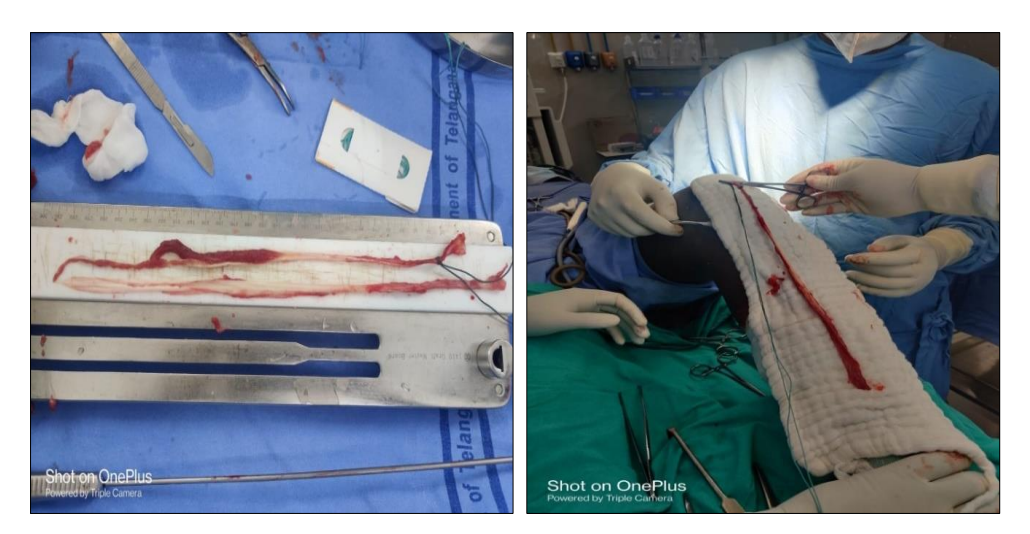
Fig 3: Graft Preparation & Tensioning