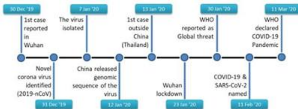
Figure 1. The initial chronology of the appearance of COVID-19 until the status of a pandemic is declared by WHO [5] .

SARS COV-2 is a family of beta-CoV, which is known to induce a systemic manifestation such as severe respiratory disorder in humans and mammals. This family virus type has already been involved in two previous pandemics, the SARS ( Severe Acute Respiratory Syndrome ) in 2003 and MERS ( Middle Eastern Respiratory Syndrome ) in 2012. [7-9] It has the largest single RNA strand with a diameter of less than 60-140 nm with around 30.000 nucleotides. [10,11] The main transmission route is through droplets and direct contacts, although the asymptomatic patient may also be able to transmit this virus. [12] This virus also is reported to stay active on the material surface, such as stainless steel and plastic materials for 72 hours, less than 24 hours on the carton, and less than 4 hours on copper material. [1]