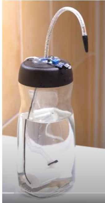
Fig 2 Hardware Implementation of proposed system

The Fig 2 shows the hardware implementation of the proposed system in which you can see the PIR sensor in top of the bottle which is used to detect the human presence and a motor pump is used to dispense the sanitizer from the bottle to the user.