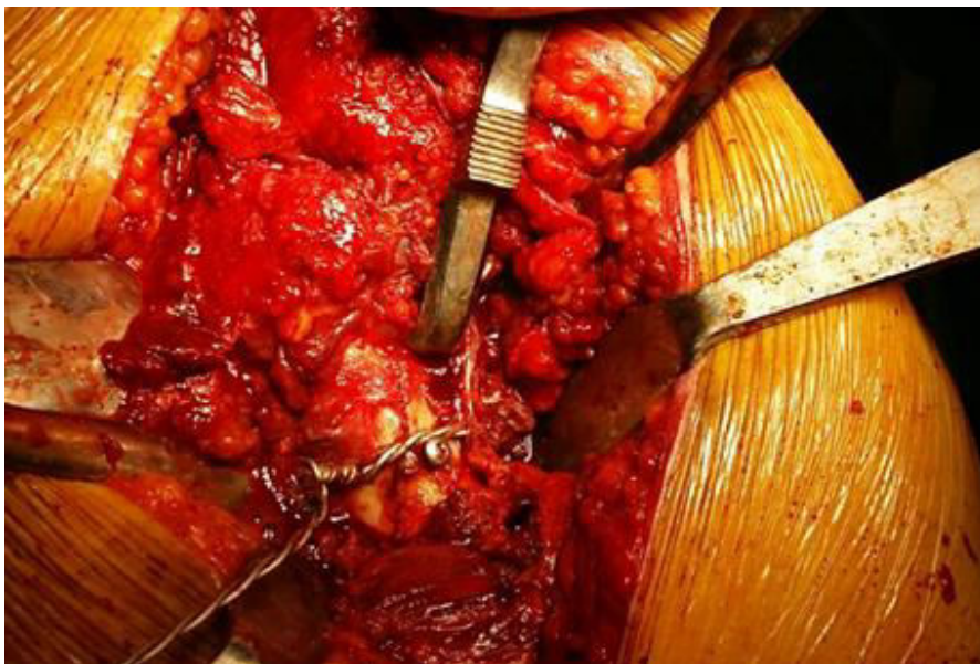
Fig 2. Fixation of bone fragments.