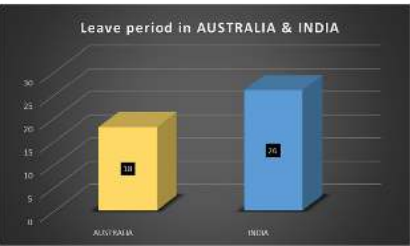
Chart No: 2