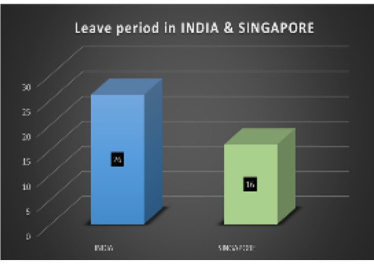
Chart No: 1