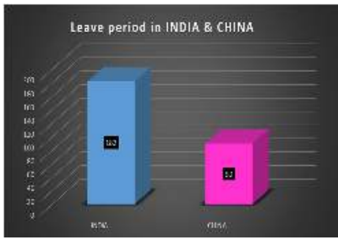
Chart No: 3