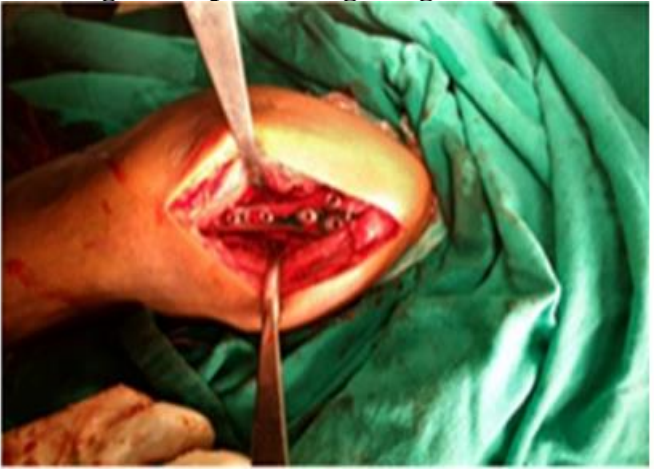
Fig. 4: Fracture fixation with plate in-situ