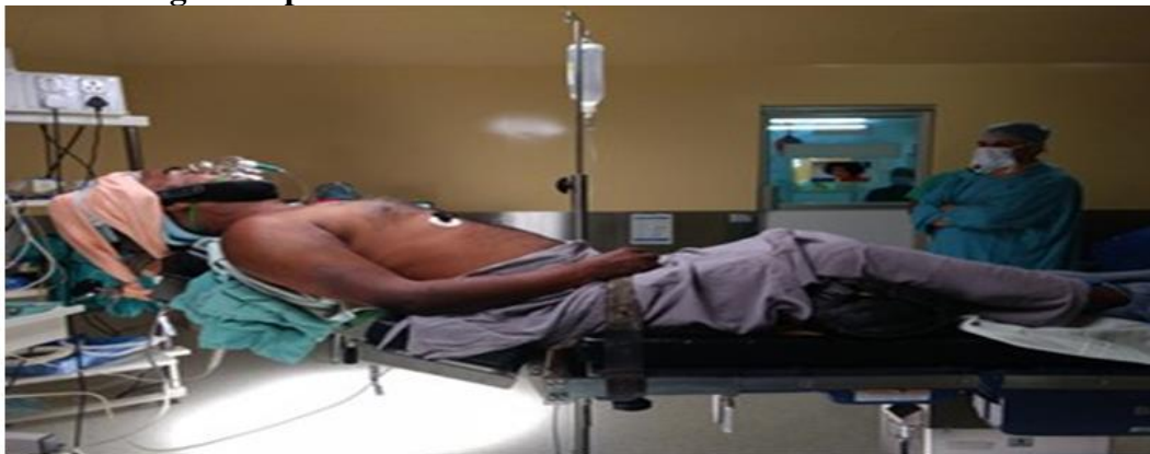
Fig. 2: Beach chair position for hand to lie on arm rest

Fig. 1: Implants and instruments used for fracture fixation