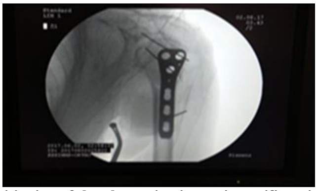
Fig. 3: Positioning of the plate using image intensifier with K wires