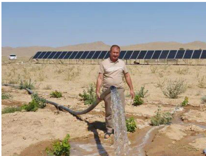
Figure 2. Water-lifting plant using a photovoltaic plant installed by Chagatai invest »

power plant carried out within the framework of the international project "Sustainable development of agriculture and climate change reduction".