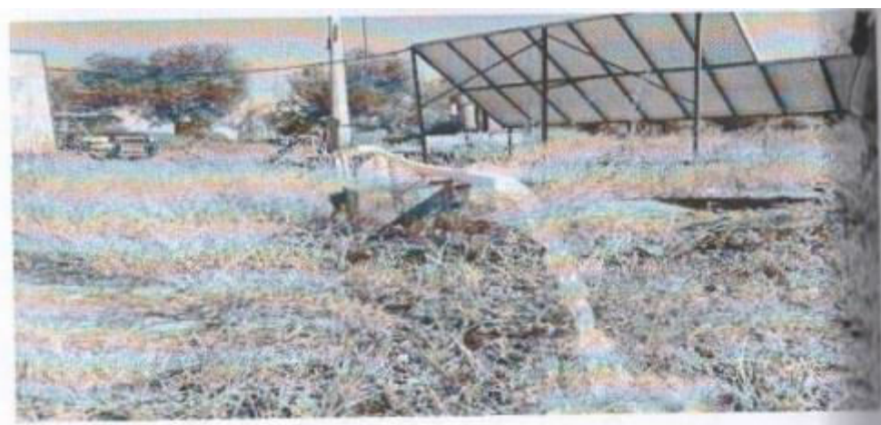
Figure 3. General view of the water-lifting installation of an energy-provided solar photovoltaic plant implemented within the framework of the international project "Sustainable development of agriculture and climate change reduction".

Recall that at present, teachers of the Department of EEE of the Andijan Machine-Building Institute, in collaboration with specialists from