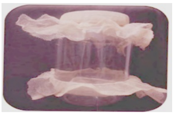
Figure 3: Egg laying apparatus

The larval period lasts for about 25-30 days. The last larval instar (LLI) measures about 14-15 mm in size. They pupate within the food. Sex differentiation can be done at the pupal stage based on the distance between the genital pores (located in the abdomen portion).