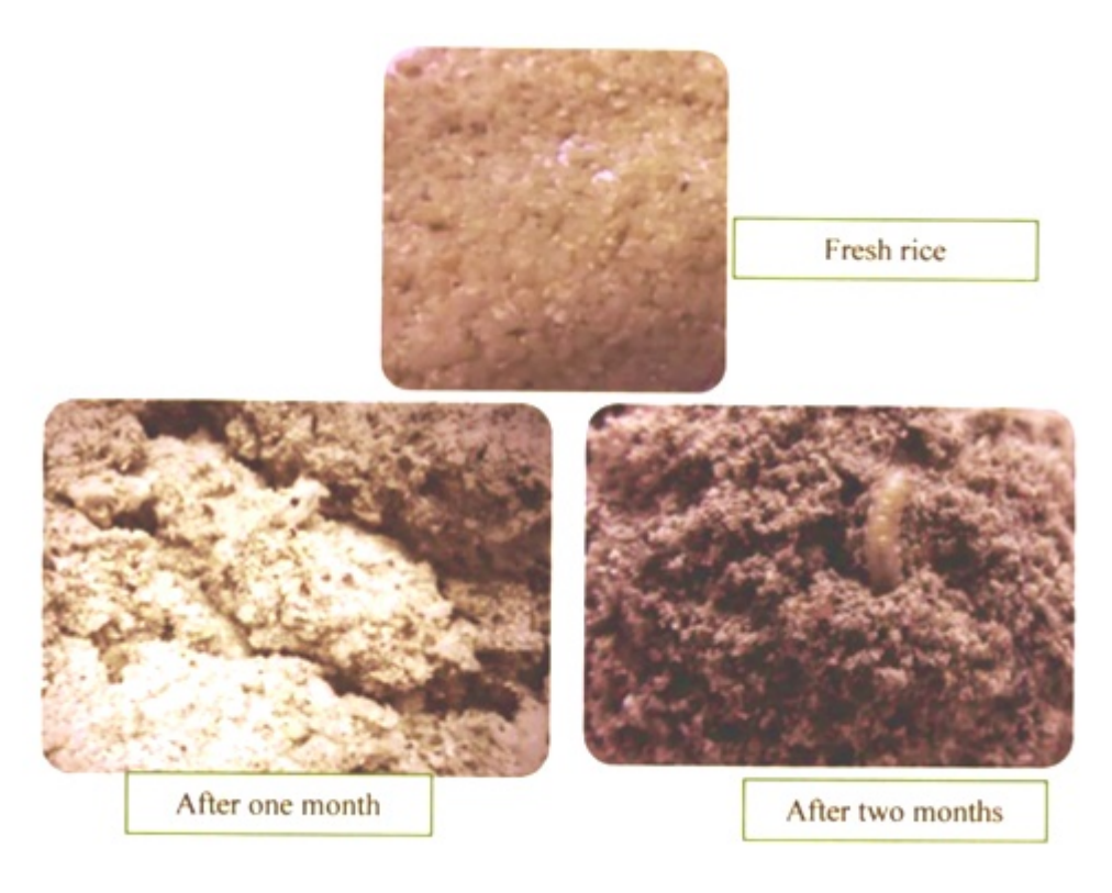
Figure 4: Different stages of infestation office Corcyra cephalonica

The grains will get contaminated by these grain clusters as well as the feces and exuviae of the larvae. The dampness that is produced as a result of the continual secretion of web will lead to a rise in the prevalence of fungal infection in grains. All of these things will render the grain useless for human consumption. Chemical pesticides like malathion and deltamethrin are fumigated or sprayed from the air to control rice moth populations in warehouses (Daglish, 1998).