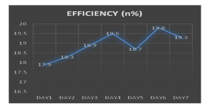
Fig. Graph between the efficiency of the panel and the days observed that is increasing.