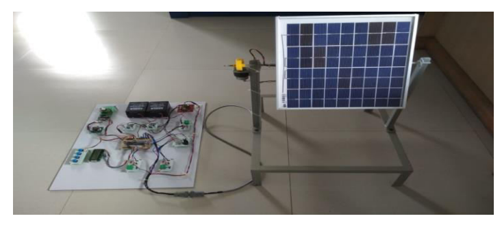
Fig: Front view of the module

Fig. Graph between the efficiency of the panel and the days observed that is increasing.