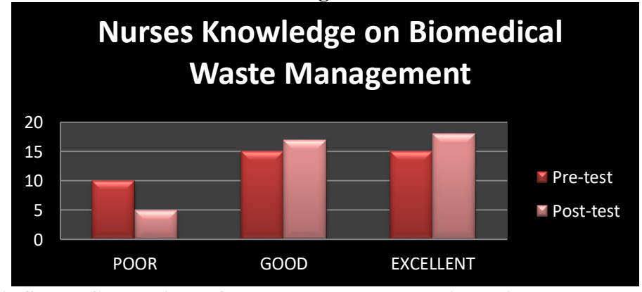
Graph 3: Shows Comparison of Nurses Knowledge on Biomedical waste management