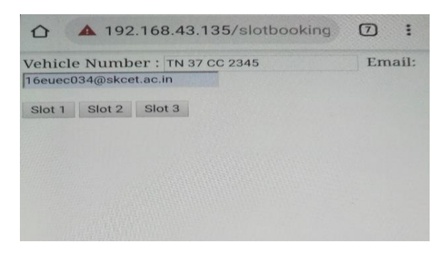
Fig 2. Webpage for the user to book slot