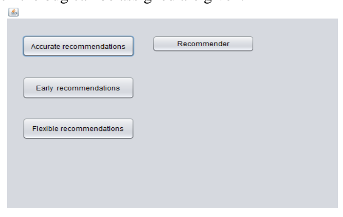
Figure.3. Description of the bugs

The recommendations to which the bug can be assigned are given: