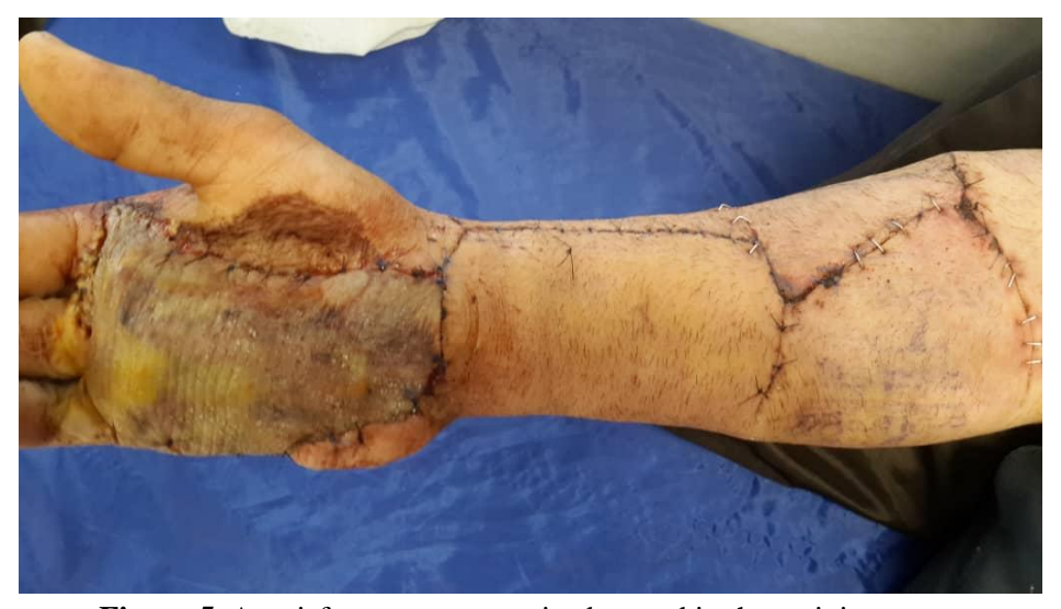
Figure 5. A satisfactory coverage is observed in the recipient areas

After surgery, a satisfactory coverage is observed in the recipient area. Although, longer time will be needed for complete evaluation of hand function but in early post operative period hand function and pain improved with compared to pre operative time. The advantages of this proposed technique are better donor site morbidity, easy implementation, simultaneous coverage of complex defects, avoidance of long-term immobilization and related complication such as shoulder and elbow stiffness, bad hygiene and avoidance of microsurgery and shorter surgery time. In addition, in this approach donor site is closed primarily and ensures a simultaneous repair of complex wounds with multiple vital anatomical structures ( Figure 5 ).