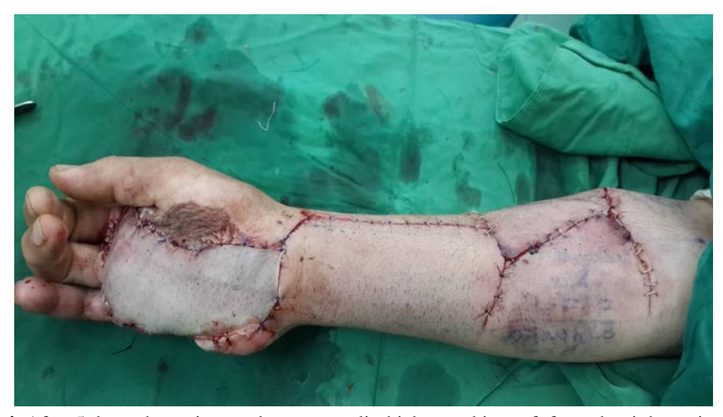
Figure 4. After 5 days, the patient underwent a split thickness skin graft from the right groin to cover the flap.