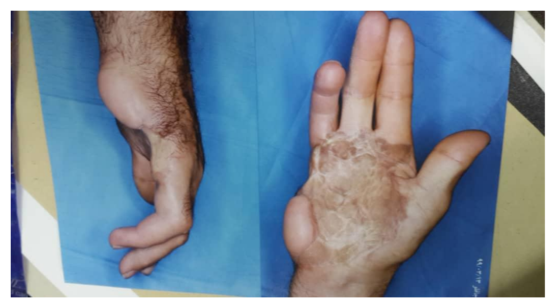
Figure 1. The defect of the right palmar due to car accident trauma in 42- year-old man

In the present study, the patient was a 42- year-old man with a history of right palmar avulsion trauma in a car accident ( Figure 1 ). The right palm has been exposed. At first this patient underwent a skin graft twice, Unfortunately, due to lack of muscle bulk, the patient suffered from severe pain and improper function in the right hand. The patient was then candidate for radial adipofascial forearm pedicle flap surgery. Patient hand vascular competencies were confirmed by an Allen's test and a portable Doppler ultrasound scan.