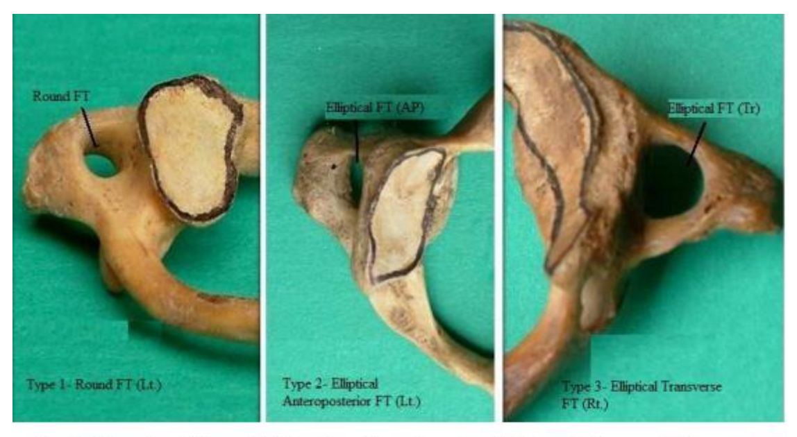
Fig.2: Superior View of Atlas Vertebra showing different shapes of Foramen Transversarium (FT); Type 1, Type 2 and Type 3

as type 5 (Figs. 2 and 3). The FT transmits the vertebral arteries, i.e. the vertebral artery and vein, and the transversarial accessory foramen may be present to compartmentalize the FT contents. So the assumption can be that the variations in vertebral vessel progression will be causes FT variation, and FT variability can be useful for estimating differences in Spinal tubes. FT defects may also mean a loss of the VA or of the artery, which runs along and narrows the transverse path. The same applies to single or double FT accessories could mean doubling of the vertebral vessels. Single and double FT and Osteophytic Accessories Trespasses on both were also observed on both the vertebral sides (figure 4).