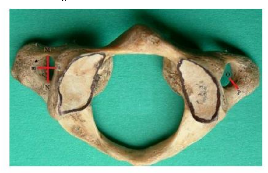
Fig.1: Superior View of Atlas Vertebra showing Dimensions of FT length, Width and Depth

aThirty dry peopletlas vertebrae with uncertain sex "(belonging to North Indian people)" were obtained through maceration from the corpses made available for dissection in the Anatomy Department. All of that the atlas vertebrae have been carefully cleaned and numbered from 1 to 30. Damaged and pathological vertebrae of the Atlas have been excluded from study. Linear FT measurements, i.e. longitude, distance, and the depth (Fig. 1), was measured by means of a Vernier caliper with minimum 0.02 mm count, and every dimension from the graduated caliper scale was then read. All aspects the bones were taken straight away and then the data was stored on the PC pad. The foramen on both sides of the Vertebrae such as Elliptical Right, Elliptical Anteroposterior, Rounded, Left-Right and Elliptical Transverse is found as being of the transversal foramen (Fig. 2 and 3). Some addition or absence of FT and osteophytic intrusions, if any, have also been studied (Fig. 4). The t-test of the pupil was used to determine the existence of any discrepancy between right and left spinal hands. Tests were deemed significant when P<0.05.