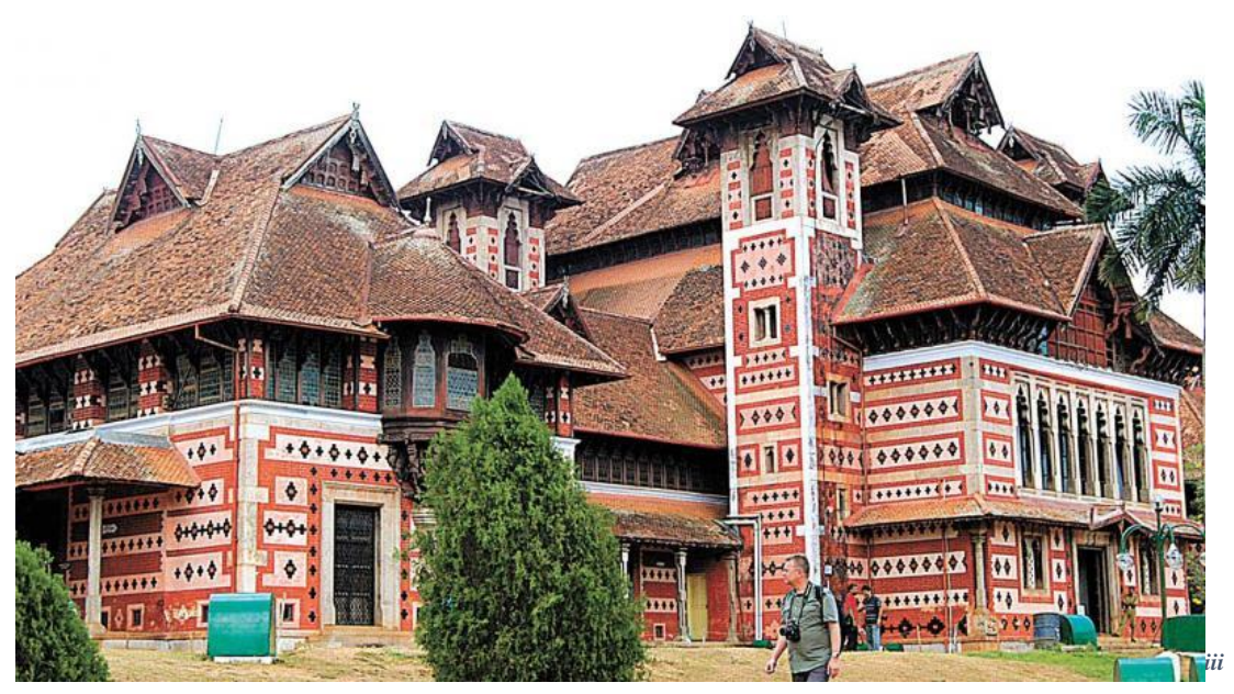
Figure 3Napier Museum, Thiruvananthapuram