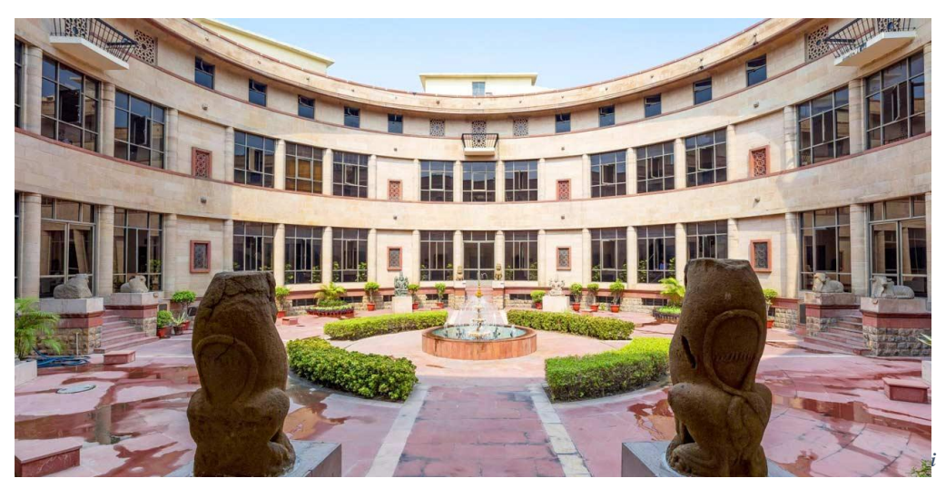
Figure 1 National Museum Delhi.

National Museum, Delhi the other name of national Museum of New Delhi is national Museum of India, established in 1949. It is the largest museum in India. the ministry of culture in India and the Government of India Look after to this museum. the idea of building this national Museum for India was given by Sir Maurice Gwyer who was the Chief Justice of India and Vice Chancellor of Delhi University on that time. according to the research during 1947 -1948 an Exhibition of Indian art and craft was organized by Royal Academy of Fine Arts, London. which gave the Indian art and craft the status of High Art. after which the decision was taken to make a permanent national Museum in Delhi. There are approximately 200,000 art works displayed in the gallery. For the display of work many departments were built in the museum like. Manuscripts: There are our 14000 manuscripts and text in the