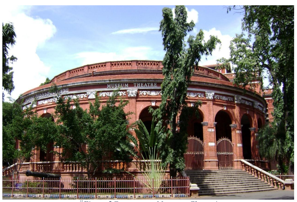
<sup>ii</sup>Figure 2Government Museum, Chennai

Government Museum, Chennai. the Government Museum is also known as Madras museum. The proposal of making this Museum in Madras was first given by Madras literary society in 1846 then this museum Established in 1851. It is the second oldest museum in India and the 10th oldest Museum in the world and comes on 3rd number in the world's largest museums. the owner of this Museum Are Ministry of culture and government of India. the Museum is divided into many different sections like. art galleries in which many paintings of Raja Ravi Verma and contemporary art were exhibited and many other works like British portraits, holography and traditional paintings were also exhibited, Anthropology in the anthropology section the art works related to folk religion, Indus Valley civilization, musical instruments, arms &Armours, puppetry and many other works related to pre-history were exhibited there, Archaeology in this section many amazing and beautiful sculpture from our history were displayed like Jain sculptures, Amaravati sculptures, Hindu sculptures, north &