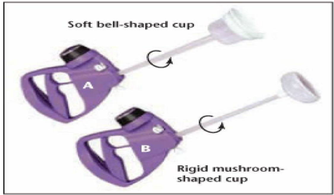
Figure 2. Types of vacuum cups[11].

Figure1. Malmström ventouse. The original vacuum extractor developed in the 1950s by the Swedish obstetrician Dr. Tage Malmström is shown, including the metal mushroom cup (M cup), traction bar, and suction device [11].