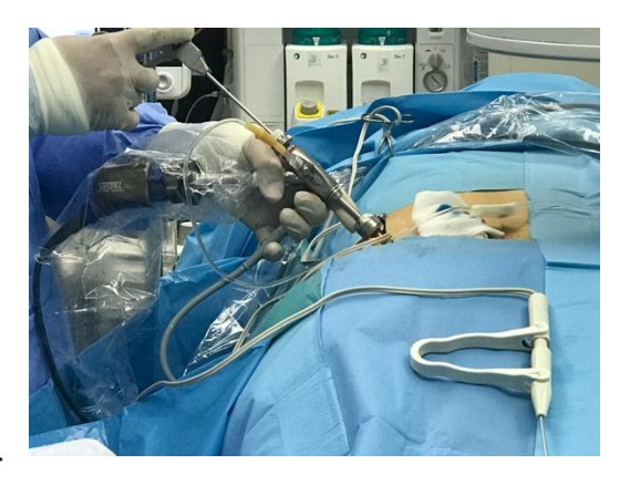
figure 3: posterolateral approac