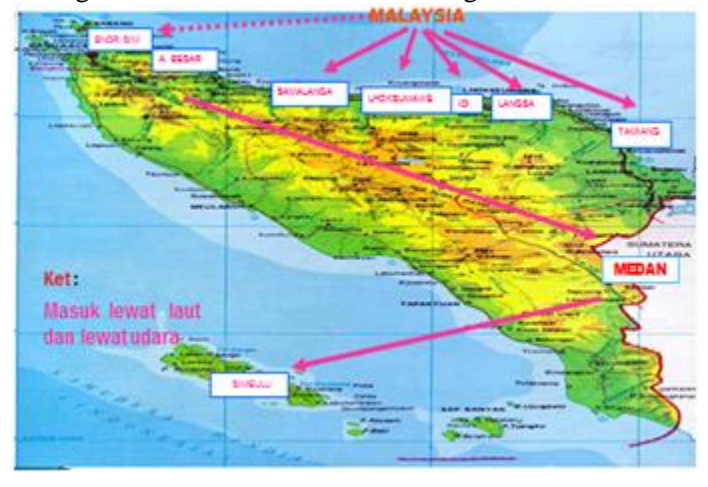
Figure 1 shows Cannabis trafficking routes to Aceh

Aceh today has a narcotic drugs emergency; even a death penalty is not enough stop it. The absence of social cultural and customary preventative measures to the drug problem calls for the need to establish such efforts, a mechanism where society is empowered to detect and reprimand culprits with social punishment. There is also need for cleaning up conspirators of drug dealers in law enforcement agencies especially at popular transit and entry points like ports and airports. The government has put more efforts on massive social initiatives to create awareness of the dangers of drugs. Schools especially at senior secondary level are closely monitored as they are an easy target for drug dealers since children at this level are in transition between adolescent to adulthood and very vulnerable to life's problems, and drugs seem to offer quick solutions.