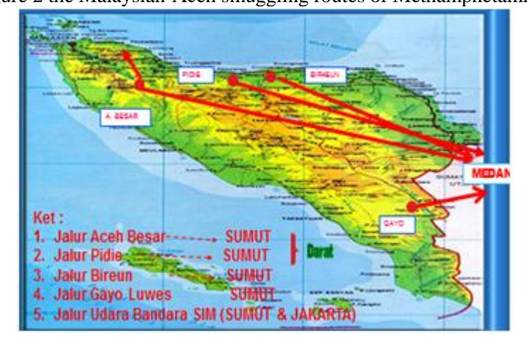
Figure 2 the Malaysian-Aceh smuggling routes of Methamphetamine.

In general, some efforts to combat drug crimes in Aceh are through penal and non-penal means. The strengthening of the law on drug crimes and tough penalties to curb the rampant narcotics crimes is basically a step forward in policy, though penal means put more emphasis on crackdown and repression after a crime has been committed. Narcotics law enforcement authorities like the Police, Prosecutors, and the BNN prosecute perpetrators as a deterrent measure.