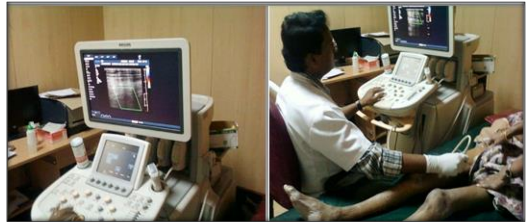
Figure 1: Colour Doppler Ultrasound Machine, pre–Operative Doppler Scanning

trial prior to surgery. In addition, they had additional investigations such as PT and a PTT blood tests, as well as a Doppler ultrasonography to perform a radiological screening for deep vein thrombosis (DVT). Our institute was the site of a prospective study between November 2021 and August 2022 that included fifty patients scheduled for THA, TKA, or HRA, in that sequence. Every patient gave their informed consent before receiving treatment. All of the study participants underwent a thorough clinical history and examination in addition to an interview. This was done to rule out the presence of thromboembolism risk factors, such as a history of smoking or drinking, chronic venous insufficiency, stroke, varicose veins, malignancy, renal insufficiency, recent myocardial infarction, heart failure, who were taking oral contraceptives, or who were taking steroidal medication. Using a linear array high frequency probe 9-11 MHz with a grey scale and colour Doppler mode, each patient had a preoperative examination for deep vein thrombosis (DVT) performed on both of their lower limbs. This was carried out using a Philips IU-22 ultrasound scanner. All of the Doppler reports were read by the identical radiologist who, in an effort to reduce observer bias, was unaware of the pharmacological prophylaxis and the study. The goal was to reduce observer bias by doing this.