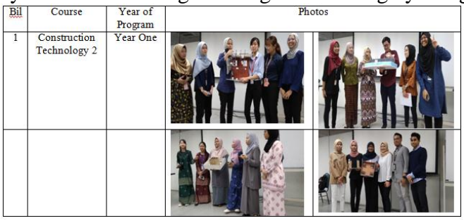
Table 6 : Photos gallery of students during teaching and learning by using 3D Mock-up Model

From the observation, Table 6 shows that the students enjoying the group works and improving the learning environment and motivations.