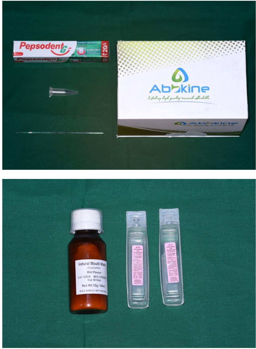
Figure 2(a) & (b). Interventions used in the study

The study was conducted with the approval of Institutional Ethical committee. The nature of the study was explained to the participants and informed consent was obtained from them prior to the GCF sample collection.