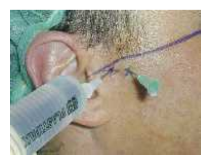
Fig. 5 Arthrocentesis

Nitzan introduced arthrocentesis, simplest and minimal invasive form of surgery in the TMJ (Fig. 5). It release the articular disc and to remove adhesion between the disc surface and the mandibular fossa by means of hydraulic pressure from irrigation of the upper chamber of the TMJ. It is very effective procedure in patients with persistent or chronic closed lock and anchorage in the upper articular space. Lavage of superior joint space with saline exerts its effects through its ability to eliminate joint effusion to reduce the symptoms.