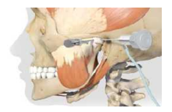
Fig. 4 Arthroscopy