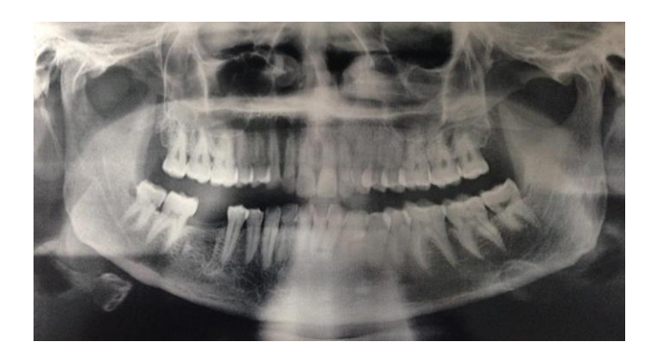
Fig 3: Panoramic radiograph of the patient