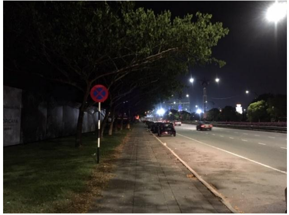
Figure 3. Visitors park their vehicle on the shoulder of the road at Pantai Lido waterfront and passed by the construction fence for fishing, doing leisure activities, resting, and watching the views

are very close to each other because they had few social activities at Pantai Lido. In essence, they agreed that they had a specified "cultural space" for community gathering. Hence, the availability of Pantai Lido's cultural landscape brought social and religious functions and feasts. Nevertheless, the current circumstances happened along the seashore that has been blocked from sharing of the public compounds between one family with another is raised. During the participant observation at Pantai Lido, some Malays area has been encroached by the construction development along Pantai Lido's waterfront from having leisure activities (Figure 3).