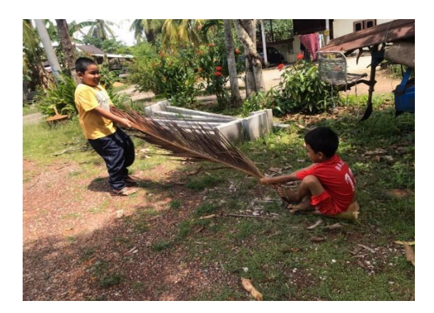
Figure 2. An example of Malay traditional game of "tarik upih". According to the informants, they used to play "tarik upih" during their childhood in the field near to Pantai Lido waterfront. The game's apparatus came from the natural environment; such as blisters of palm.

From the interviews with the informants, there is a noticeable and significant attribution of landscape elements and public open space such as fields and social platforms at Pantai Lido. MO 6 expressed about the free space during the interview session, referring to the field of Padang Seri Gelam for community gathered and the kids played previously. Again, the physical activities that occurred around Padang Seri Gelam shown the formation of the Malay cultural landscape character. Below is an example of a traditional event that the community usually played engaging with each other at Pantai Lido (Figure 2).