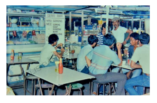
Figure 4. One of traditional Malays community activity, such as having some street food vendors along the Pantai Lido, its glues people together in one place (source: Info-MBJB, 2019).

According to Firduansyah, Rohidi, and Utomo (2016), the local community did social trading and leisure activities are the main factors that generate a more significant urban place by emphasising on the town, social, and cultural perspective. Thus, the elements of socialcultural, socioeconomic, and recreational activities occurred when locals engaged with the cultural landscape activities involving the wholesale market, sports facilities, and social gatherings either on the streets, in the marketplace, or the waterfront. The finding expressed that social-cultural and socioeconomic activities at Pantai Lido are related to leisure and recreational activities. The variety of cultural practices at Pantai Lido gathers with the community, their routine of life, and the movement pattern. It has created such a balance among the phenomenal experiences, landscapes, and physical elements. Thus, the finding