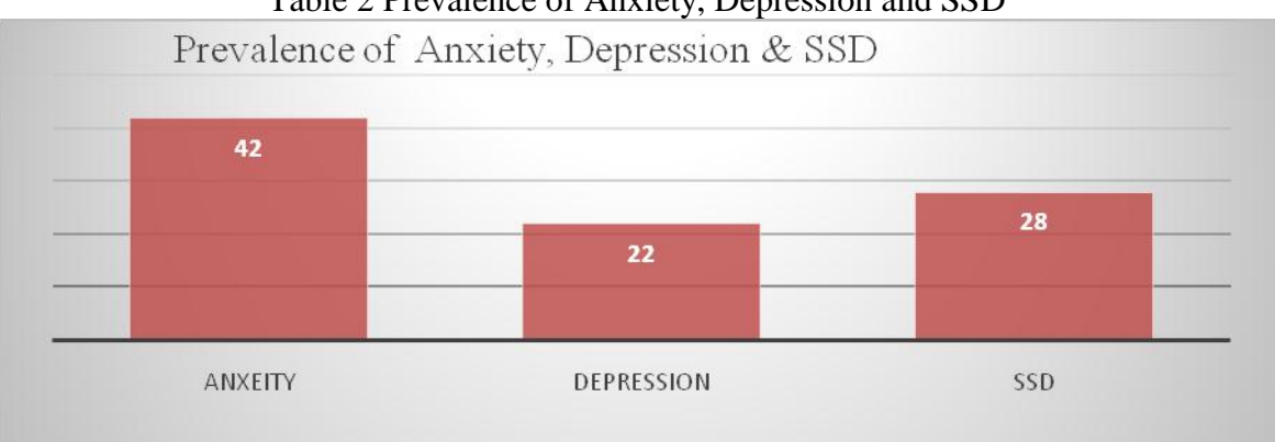
Table 2 Prevalence of Anxiety, Depression and SSD

Out of 47 GHQ positive cases, 28 were male and 19 females. The prevalence of anxiety, somatic symptom disorder and depression in this studied sample was 42%, 28% and 22% respectively.