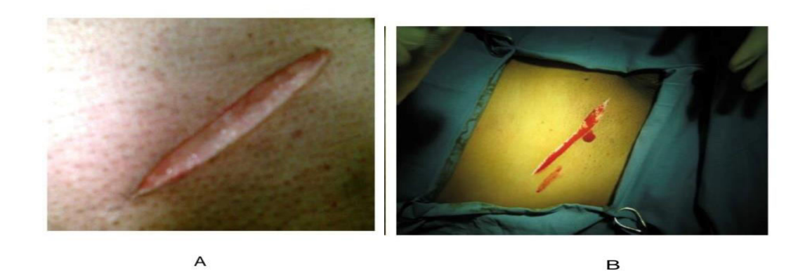
Fig.2: Incision wound site after incision with A-Electrocautery B-Scalpel

The following observations and results were found in the present study.