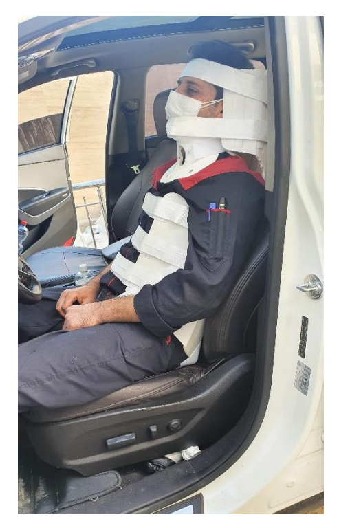
Figure (3) putting NSIV in car

After making the prototype in terms of weight, volume, solidity, and final price, we took a closer look and found that it was lighter, smaller, compact, cheaper and more immobilization than the current prototype.