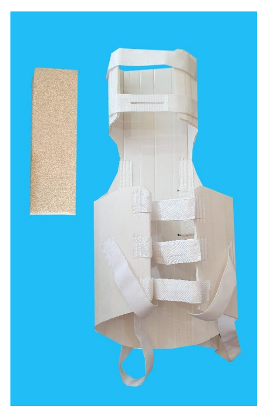
Figure (2) NSIV with its pad

After preparing the splint, it was tested on a number of individuals. The result showed that the prototype had to be modified in some cases. For example, the length of some strips, the angle, and the location were not exactly accurate.