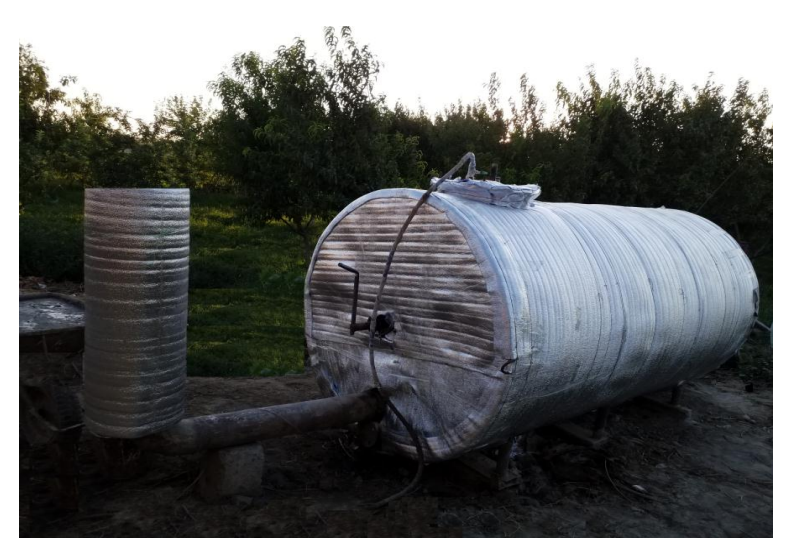
Figure-3. General view of a pilot production biogas plant

The application of this technology will allow the most complete use of energy and raw materials potentials contained in organic waste. In addition, these plants can process one structural organic waste such as cattle, chicken, pig and others separately.