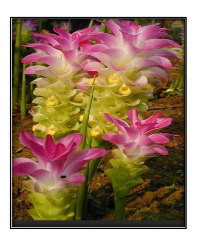
Figure 1:Image of C.Aromatica plant ariel parts and underground rhizomes