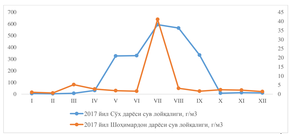
Figure 3. Turbidity of the water of Sokh and Shahimardan rivers, g/m<sup>3</sup>

River waters are not only rich in anions and cations, but also have suspended solids. The amount and quality of sediments depends on the mechanical, mineralogical composition and organic matter of the catchment and bed of these rivers, the slope of the bed, the season of water formation, the quality and quantity of precipitation and other factors. The Sokh River and Isfayramsoy can be