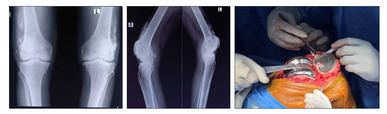
Fig 3: Pre-operative Radiographs 3150