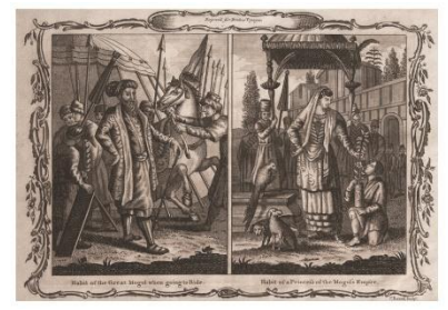
Figure No 12. Maghul Princess and Princess (circa 1770) On the left is the lifestyle of the great Mughal when going for a ride and on the right is a princess visiting a market. From Edward Cavendish Drake's, 'A Universal collection of Authentic and Entertaining Voyages and Travels', 1770. Drawn & Copper engraving by J. S. Record for Drakes Voyages created to illustrate a voyage of exploration and discovery across the world Size: 8.25 x 13.25 in. (21 x 33.7 cms.) Date of printing – 1768