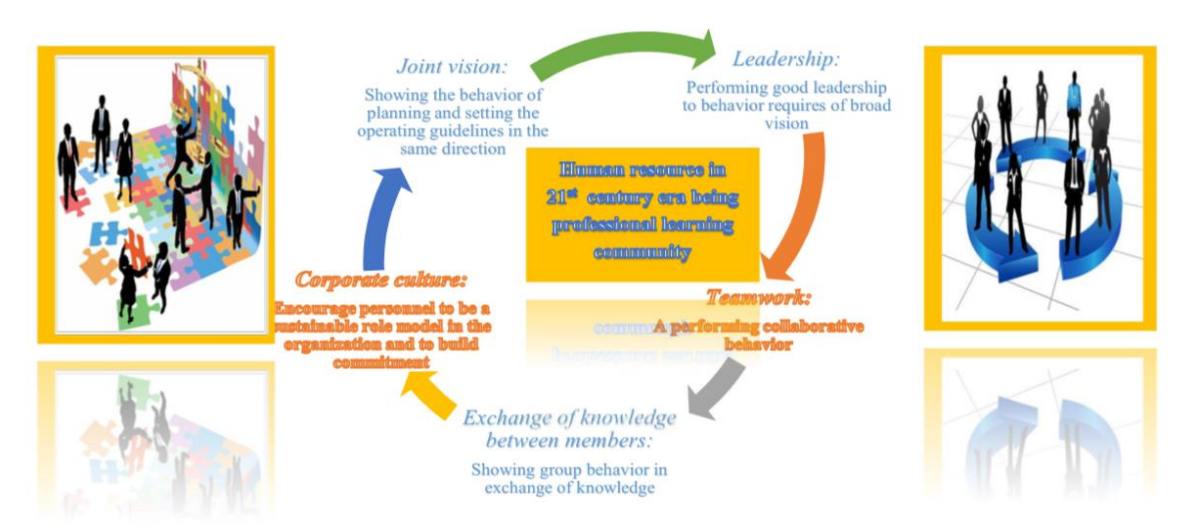
Figure 2:- 5<sup>th</sup> main factors to Human resource in 21<sup>st</sup> century era being professional learning community to sustainable local government organization.