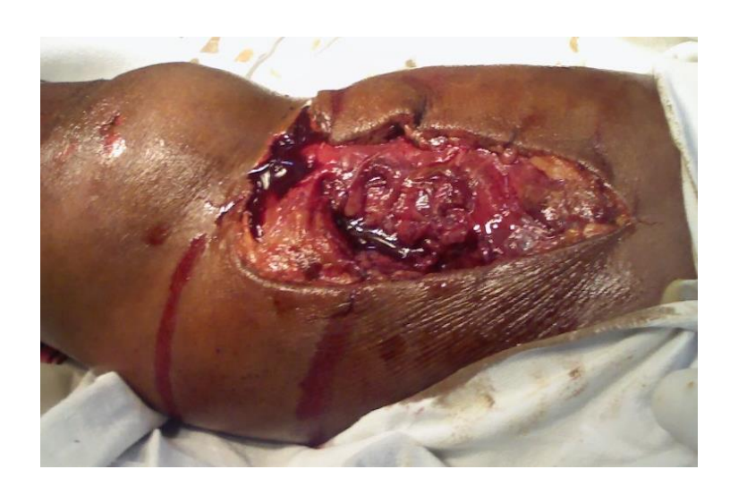
PIC 1: OPEN WOUND IN DISTAL FEMORAL REGION (TYPE IIIA)