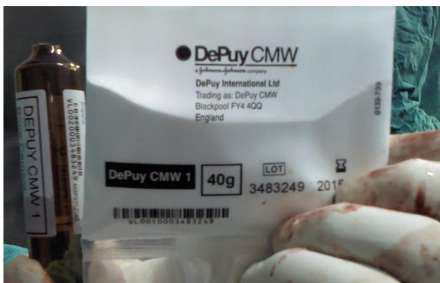
PIC 2: PATIENT UNDERGOING PRIMARY INTERNAL FIXATION WITH DISTAL FEMORAL LOCKING PLATE

A typical dose of 4.0 g Vancomycin was added to 40 g of PMMA. Vancomycin was used as it is enough heat stable to withstand the exothermic reaction produced during cement mixing and its broad spectrum activity against those organisms which are commonly encountered in open fracture. For making beads the mixture of antibiotic and PMMA and methylmethacrylate was molded or rolled to 3-10 mm spheres and then strung on to S-S wire no.20G/22G.