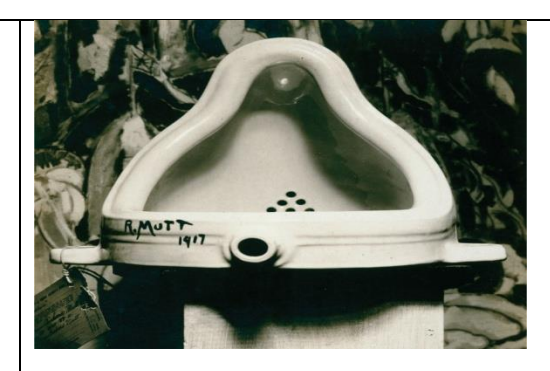
Figure 2, Marcel Duchamp Fountain, 1917, photograph by Alfred Stieglitz.<sup>5</sup>