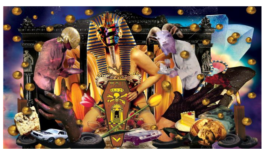
Figure 3, This artwork is very close to design and artistic art, Kaleidoscopic Collage.GAWDOFGAUDS. IMAGES COURTESY THE ARTIST<sup>7</sup>