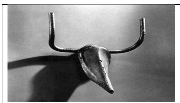
Figure 1, Pablo Picasso. Bull's Head. Paris,

But for many, using computers in their art is simply using a new tool. We have always regarded cameras not as being creative but rather as allowing new creativity in humans. The practitioners of computer art are experimenting in the same way, exploring whether the restrictions and possibilities take us in new directions.