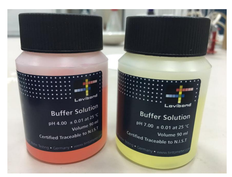
FIGURE 2: ARMAMENTARIUM USED IN THE STUDY