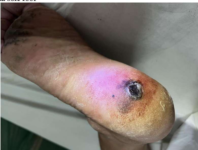
Fig 1: Melanoma sole foot

The postoperative complication rate was an important parameter to assess surgical success. The complications associated with salvage surgery using cutaneous flap reconstruction were observed in three patients. Two patients developed a mild infection at the incision site and. The symptoms disappeared rapidly following symptomatic treatment. one of the patients developed partial necrosis at the distal tip of the cutaneous flap, however, managed successfully with debridement and regular dressing.