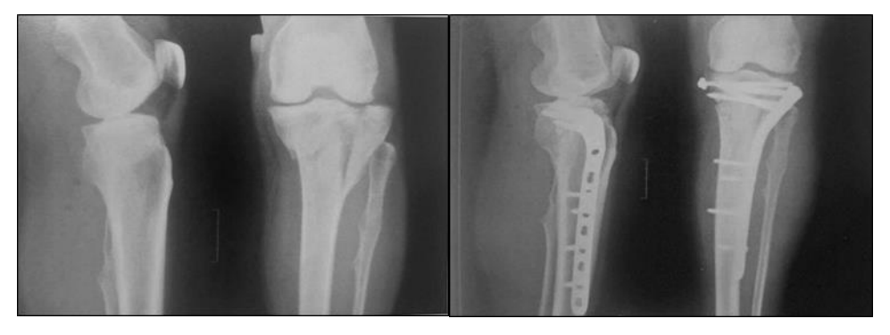
Preoperative X-raysImmediate Post-Operative X-raysFig 8 & 9: Pre-Operative and Immediate Postoperative X-Rays