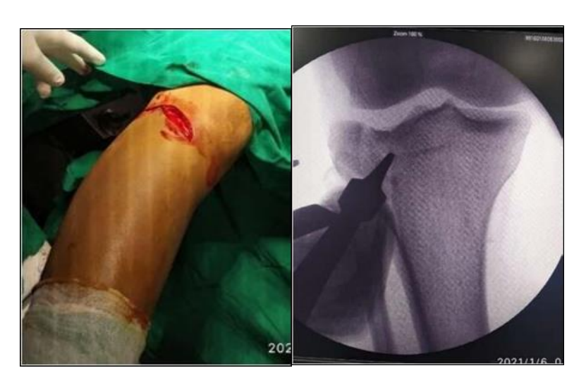
Fig 4&5: Incision & Reduction under C Arm Guidance