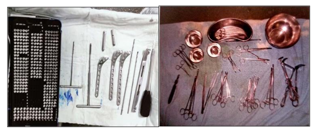
Fig 1: Implants

Articular step off: Measured in plain X-ray, < 2mm is acceptable.