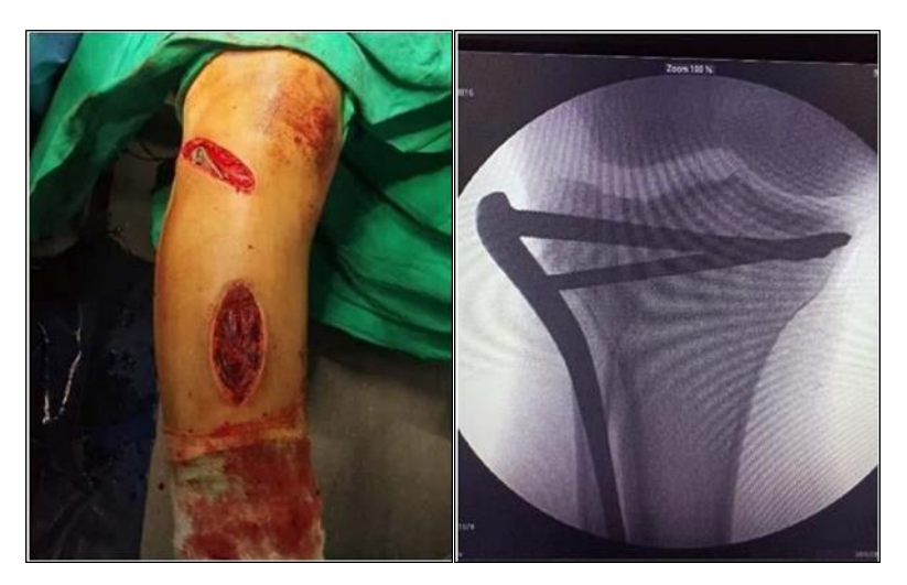
Fig 6: Plate Inserted