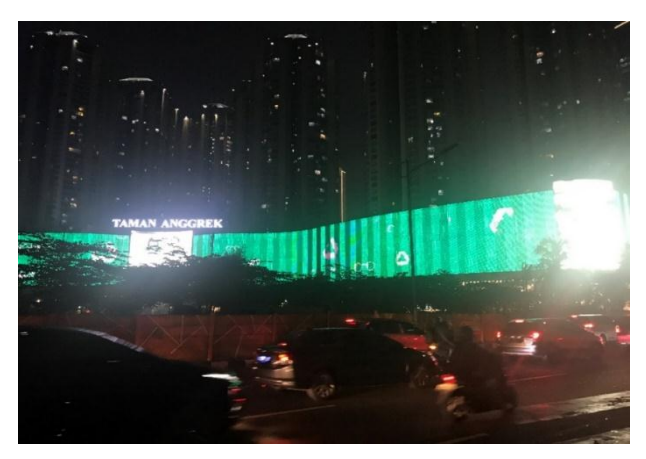
Figure 7. Mall Taman Anggrek Urban Screen