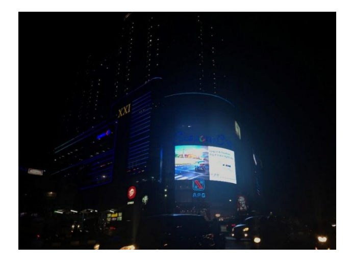
Figure 9. Season City Urban Screen (Sources: Santo, 2019)