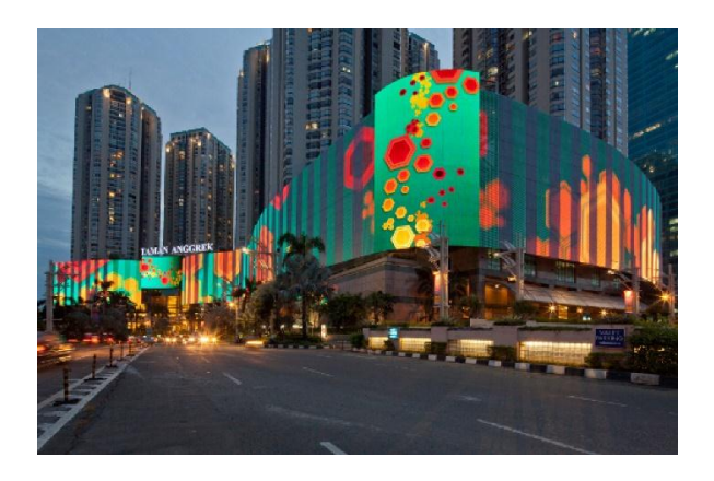
Figure 2. Taman Anggrek UrbanScreen