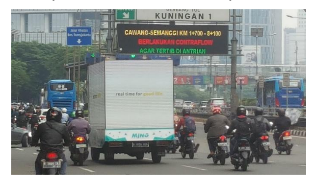
Figure 6. Mobile Urban Screen

(creating interest) and must be embedded (in memory). Ads must attract attention (attention), attract interest (interest), easy to remember (memorability) (8). Ads must have sticking power.