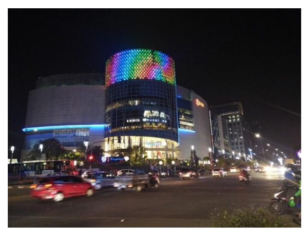
Figure 10. Emporium Pluit Urban Screen

An urban culture that creates urban society is expected to be a phase for people to be able to transform into a process of greater social change. Urban screens that are contained in urban spaces and continue to grow, can be interpreted as having a deep communication value to the urban community of Jakarta, because the screen raises an exchange culture, and is understood by urban society, as an example of the appearance of a large screen shape and is attached to a towering building, which is an identity of an urban community.