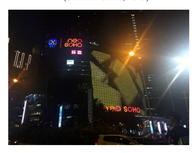
Figure 8. Neo Soho Central Park Urban Screen