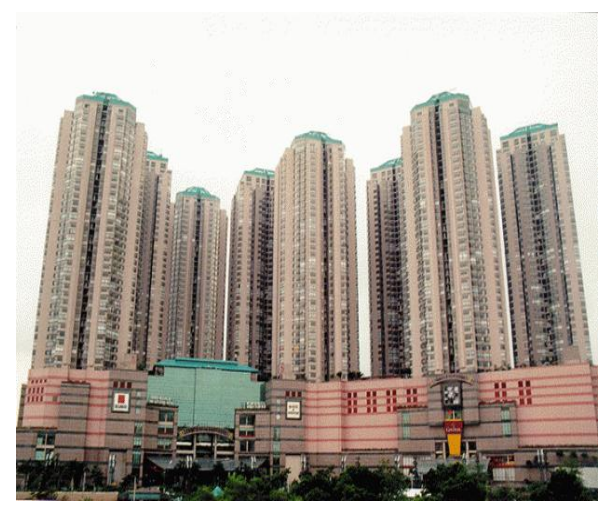
Figure 1. Taman Anggrek shopping center

Interesting and unique interior concepts are common, so that building managers and shopping centers turn to improvements in the exterior sector so that at the moment there are many attractive exterior displays in shopping center buildings in Jakarta(3). Of course, this becomes a new landmark for the city and the surrounding area. Some major shopping centers that make changes to attract are the Taman Anggrek shopping center, Neo Soho Central Park, Season City, and Emporium Pluit. For example, the Taman Anggrek shopping center building uses an urban LED screen on the exterior display of the building, by building an LED Facade covering an area of 8,675.3m2 which follows the curve of the building with dynamic moving lights and displays animated color images. In the world is dominated by various visual relations - rather than hearing and feeling - the screen becomes an important force (4).