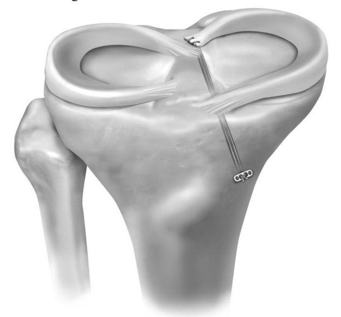
Figure 2: Transtibial pull-out repair technique used single transtibial bone tunnel . 2 No. 2 nonabsorbable sutures are passed throughout meniscal roots and later pull throughout transtibial bone tunnel drilled at center of ntire posterior root of medial meniscus.<sup>20</sup>

The pull-out technique is indicate if roots were avulsed from tibial insertion. Small tunnel drilled with ACL guide at meniscal root avulsed levels. Curved suture passer was use to arm meniscal roots with 2 n°0 non absorbable suture and sutures were then retrieve throughout tunnels from anteromedial tibia and tying over post, button or anterior tibia bone bridge.<sup>10</sup>