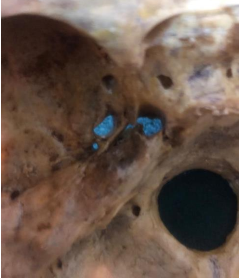
Figure-3. D- shape of FO (Lt side)