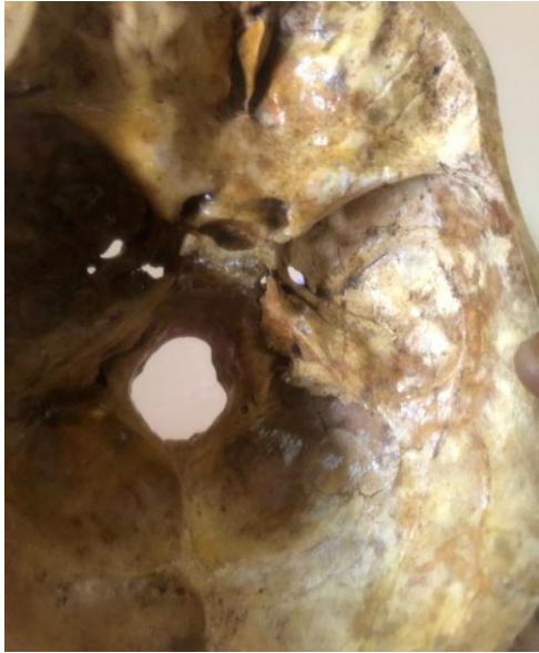
Figure-5. Irregular shape of FO (Left)