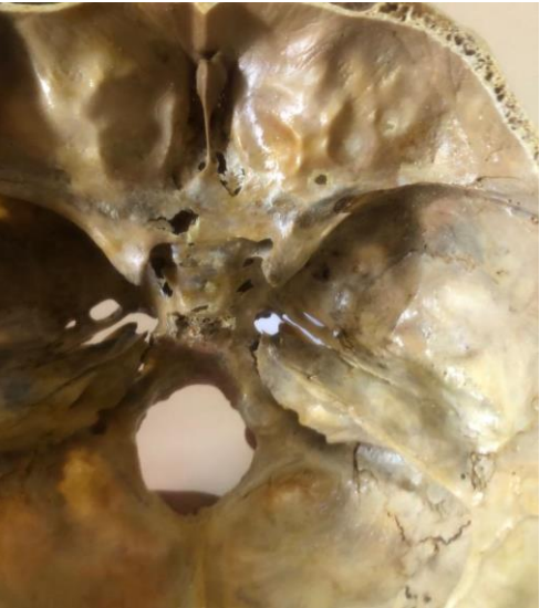
Figure-4 .Slit like FO (Rt side)