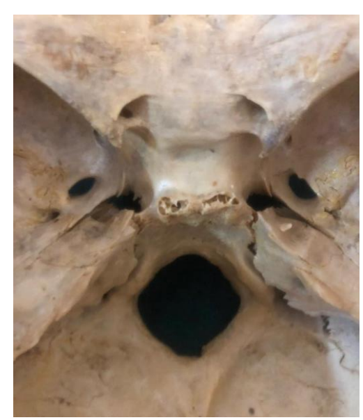
Figure-8. Showing bony septa (Right)