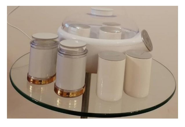
Fig. 2. Yogurt maker with a concentration system

In this research, a new yogurt maker instrument is introduced that can be placed in the home appliance basket and produce C.Y at a very low cost. The final schematic of the yogurt maker with a concentration system is given in fig 2.