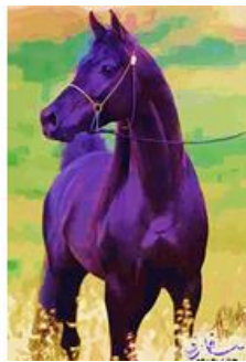
Figure ( 3 )