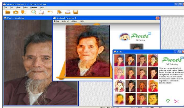
Figure (1): The different effects of filter groups from Virtual painter program

One of those programs, for example, is (Virtual Painter), whose idea is to provide sets of filters categorized into groups, including (oil and water colors, color separation, pastels, and digital art). Figure (1)