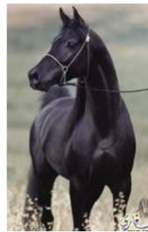
Figure ( 4 )

The abstraction stages of the image through the Virtual painter program