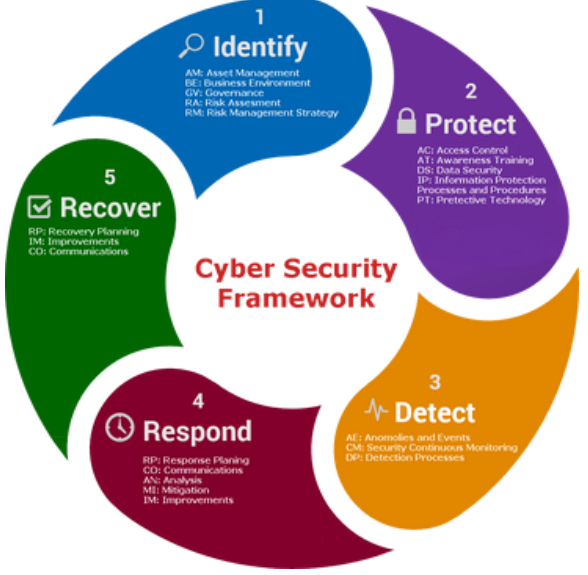
Figure.2. IT and Cyber security Frame work

hypothesis of ideal control, which is worried basically for the presence and characterization for ideal solutions, Also calculations to their correct computation, and less with Taking in alternately approximation, especially in the nonattendance of a scientific model of the surroundings. In economics and diversion theory, support taking in might be used to illustrate how harmony might emerge under limited reasonability. Done machine learning, nature's turf will be normally figured as a markov decision procedure (MDP), as a lot of people support taking in calculations to this setting use dynamic modifying strategies. Those primary distinction between the established element modifying techniques Furthermore support Taking in calculations may be that those last don't Accept learning of an correct scientific model of the MDP And they target vast MDPs the place accurate routines get to be infeasible.